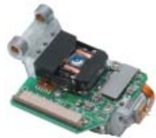
Optical pickup for DVDs