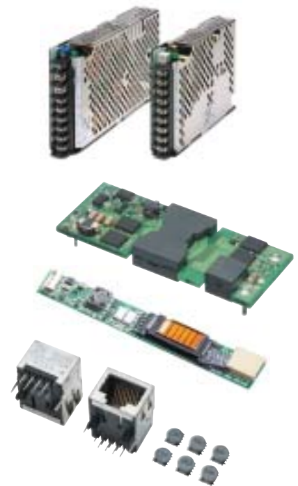
Power system products

Sales of high-frequency components decreased despite an upswing in shipment volumes that resulted from strong demand for components used in mobile phones, the main market for these components, and successful activities to win new orders. The decrease reflects the continuing glut in the supply of high-frequency components in the market as a whole, which prompted customers to demand price reductions that were greater than in other electronic component categories.