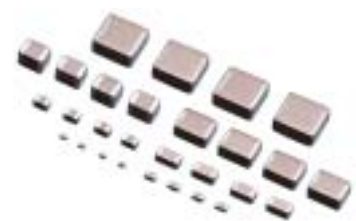
Multilayer ceramic chip capacitors

In ferrite cores and magnets, overall sales of ferrite cores decreased year on year. Deflection yoke cores and flyback transformer cores saw sales drop due to falling demand and sales prices. The drop in orders is a reflection of a rapid shift in consumer demand from CRT TVs to LCD, plasma and other flat-panel models. Higher sales of small coils and transformer cores, a category where demand is