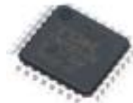
ICs for modems

Sales in the semiconductors and others sector climbed 20.7% from ¥14,865 million to ¥17,940 million, despite sluggish sales of semiconductors for communications applications. Growth reflected higher sales of anechoic chambers for noise control and equipment used in these chambers.