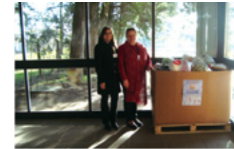
About 30% of the entire staff participated in a drive to donate clothes to those in need (EPCOS do Brasil Ltda.)

* In addition to the above examples, 12 other social contribution activities were selected for awards.