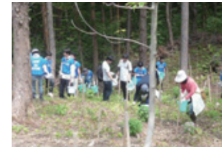
Beech Forest tree planting drive aims to significantly increase greenery in the local environment (TDK Akita region)

As a corporate citizen, TDK endeavors to contribute to society in various ways, focusing particularly on the following four