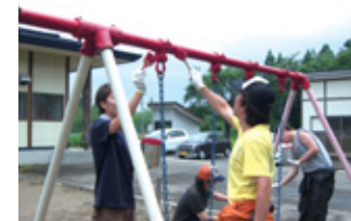
Nursery School Volunteer Group helps through weeding, toy painting, and other activities (TDK Ugo)

areas: Academic Research and Education; Sports, Arts, and Culture; Environmental Conservation; and Social Welfare and Local Community Service. In 2004, the company started the TDK Group Social Contribution Award program. For 2010, there were 56 applications, 16 of which were selected for an award.