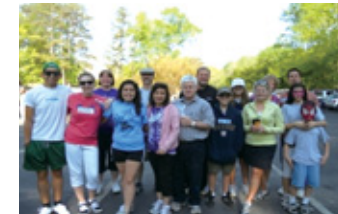
Fund raising campaign for improving maternal and child health (TDK Components U.S.A., Inc.)

areas: Academic Research and Education; Sports, Arts, and Culture; Environmental Conservation; and Social Welfare and Local Community Service. In 2004, the company started the TDK Group Social Contribution Award program. For 2010, there were 56 applications, 16 of which were selected for an award.