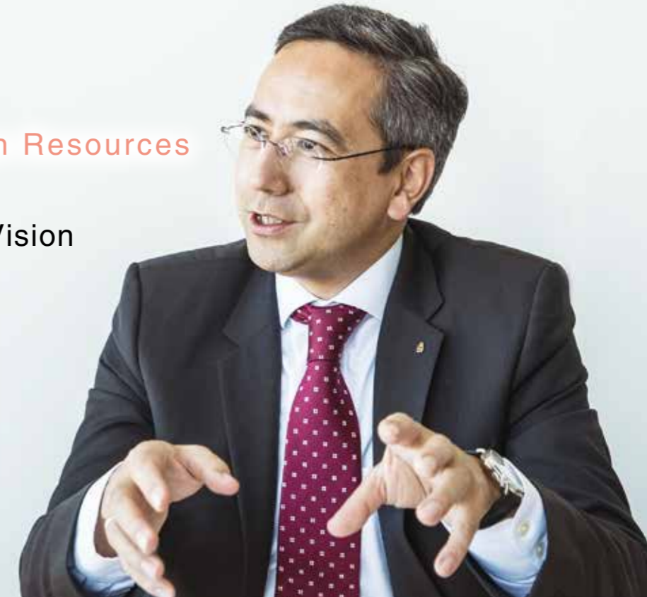
Date of implementation: March 6, 2018