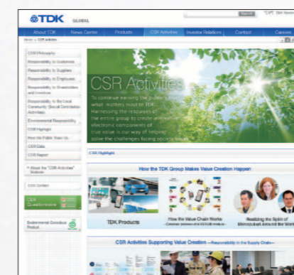
* Website with CSR activity information (illustration uses previous year's page)

We look forward to receiving your opinions and suggestions so that we may improve future activities and reporting.