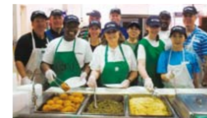
TDK U.S.A. Corporation takes part in volunteer activities to feed the hungry

From September to December 2009, Magnecomp Precision Technology produced some 2,000 audio books by reading them aloud onto CD and other media to donate to the Thai Association for the Blind. 2,000 employees took part in the effort.