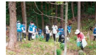
TDK Beech Forest tree planting and fertilizing organized by plants in the Akita region

TDK has been doing tree planting activities around Thailand since 2004. In July 2009, 340 employees planted some 500 trees along roadsides in Pathum Thani Province.