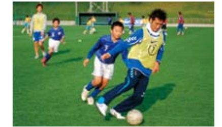
Sports workshop for elementary and middle school students

TDK has been sponsoring performances by world-class orchestras under the name "TDK Orchestra Concert" since 2001. Starting in 2003, TDK also began sponsoring events that send musicians visiting Japan to schools, where they perform and interact with students.