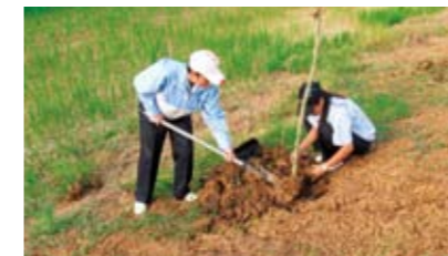
Tree planting by TDK (Thailand) Co., Ltd.

TDK is engaged in R&D activities to provide products that make people's lives more convenient. But we also work earnestly on various environmental conservation activities to contribute to the harmonious coexistence of society with the global environment.