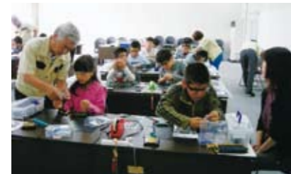
Electronics workshops at the TDK History Museum in Nikaho City, Akita Prefecture

TDK is willing to return the profits of its activities to local communities by utilizing our accumulated product technologies and human resources. Specifically, TDK wishes to offer opportunities for young people who will lead the next generation to acquire a wide range of knowledge, experiences, and skills.