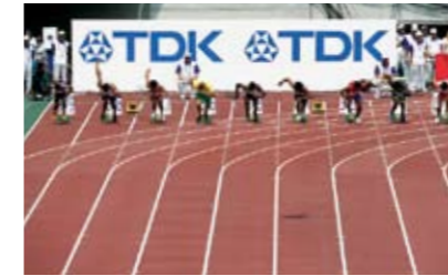
Sponsorship of World Championship in Athletics

TDK strives to be an "exciting company," capable of providing quality and excitement to stakeholders. TDK provides support in inspirational sports and art activities that uplift people's hearts.