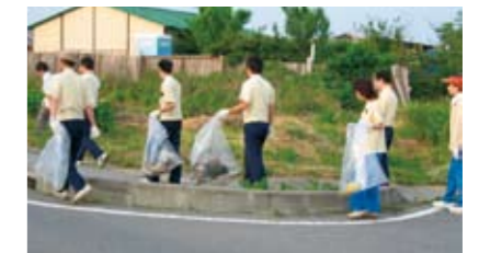
Joint volunteer cleanup campaign of the Chikumagawa region sponsored by the Chikumagawa Techno Factory and Asama Techno Factory in Saku City, Nagano Prefecture

TDK has been working to preserve a section of Mount Chokai in Akita Prefecture dubbed the TDK Beech Forest. Every year more than 100 TDK Group employees take part in planting and fertilizing. So far, 3,000 trees have been planted over 8,020 square-meters.