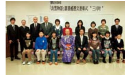
TDK Shonai appeals to peace by sponsoring book donation and essay award in Tsuruoka City, Yamagata Prefecture

In 2003, TDK-MCC began doing presentations for elementary school students in Nikaho City, Akita Prefecture on the company's environmental activities. In 2009, 4th and 5th year students at Hirasawa Elementary School deepened their understanding of the environment by learning about environmental activities such as the 3Rs—Reduce, Reuse, and Recycle.