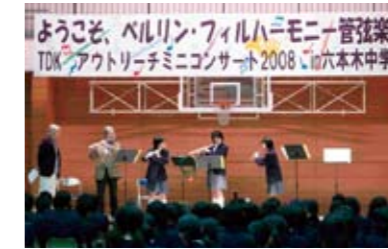
Sponsorship of world-class orchestras and events that bring musicians and students together

TDK has been an IAAF Official Partner of men's bibs since the first IAAF World Championship in Athletics, held in Helsinki, Finland in 1983. TDK will sponsor the 2011 Games in Korea and continue this sponsorship through 2019.