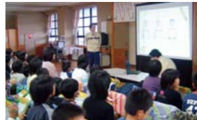
Environmental education for elementary school students at the TDK-MCC Akita Plant

Organized mostly by TDK alumni, these workshops for elementary and middle school students started in FY2008. Electronics workshops and tours of the TDK History Museum are held during summer and winter vacations. More than 500 students have taken part so far, with recent events including more students from outside Akita Prefecture.