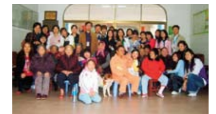
Nursing home volunteer activities by SAE Magnetics Hong Kong Ltd.

In September 2009, 23 TDK U.S.A. employees volunteered at local soup kitchens and food pantries that distribute free food to people in need. They prepared and served lunch, distributed toiletries, and performed other volunteer activities for around 600 people.