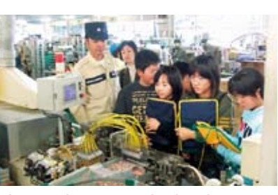
Plant visit by primary school students (TDK Uic

In March 2009, employees of TDK Components in the U.S. State of Georgia visited a local primary school on Career Day, giving a presentation to the students about their work, about the recycling and power saving efforts of their company, and about how the company complies with various regulations.