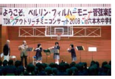
ging the world's greatest orchestras and

provides support in inspirational sports and art activities that uplift people's hearts.