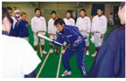
Baseball lessons for high school students (TDK Baseball Club)

In January 2009, the TDK Baseball Club held a practice session for baseball club members from high schools in the Shonai region of Yamagata Prefecture. 36 students from 8 schools received training and instruction from six TDK club members.