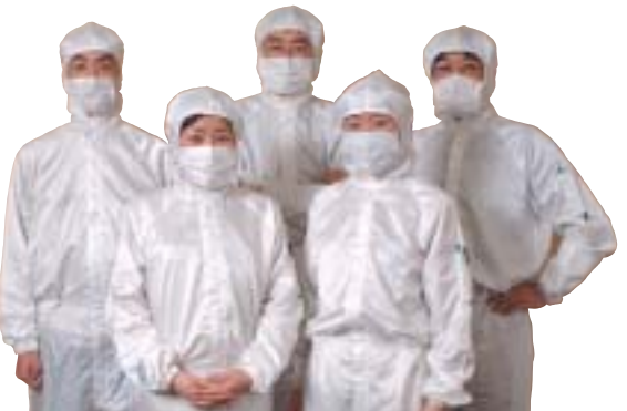
A team of researchers decked out in their cleanroom suits.