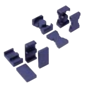
Transformer cores using power ferrite TDK's transformer cores are smaller and more slender thanks to original profiles made possible by technology for the design of optimal magnetic circuitry.

Raising production output of rare-earth magnetic materials without undermining their properties is a delicate balancing act. But solving these conflicting issues can lead to cost savings for TDK. It's a very rewarding field of research. I enjoy the challenge, knowing the potential payoffs for the company. Every breakthrough motivates me to achieve more.